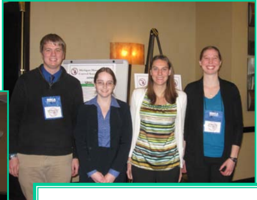
Student competition participants